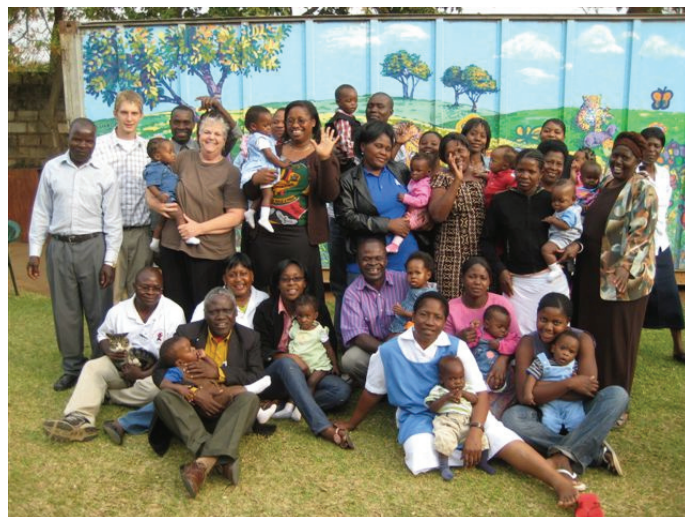
group photo of co-worker in the House of Moses

Many babies are being abandoned and then brought to the House of Moses by the police. Some of them hardly weigh two kilos and are so weak that they have to be force-fed and put into intensive care. In case they develop well the children stay up to the age of 18 months and then go into the House of Martha or the home for traumatized and abused children, the Bill and Bette Bryant