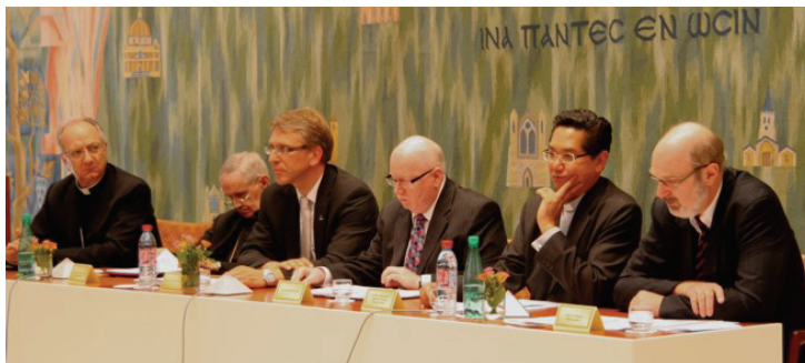
Plenum during the publication of the Recommendations for Conduct

“Mission belongs to the very being of the church.” These words stand at the beginning of the document that was delivered in a public ceremony celebrated at the headquarters of the World Council of Churches in