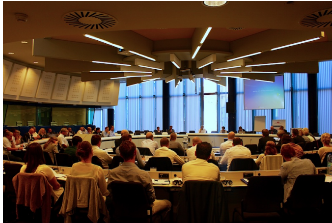
The meeting room of the EU Commission during the talk

An understanding of Islam, which either affirms the exercise of force for the “defense” of Islam or makes a call to implement Islam both politically and socially and by doing so views the classical interpretation of Sharia law as binding, does not fit with Europe: This is on account of the fact that in the middle of theology as established through a classical interpretation of Sharia law the following is foreseen: only limited rights for women, the death penalty for