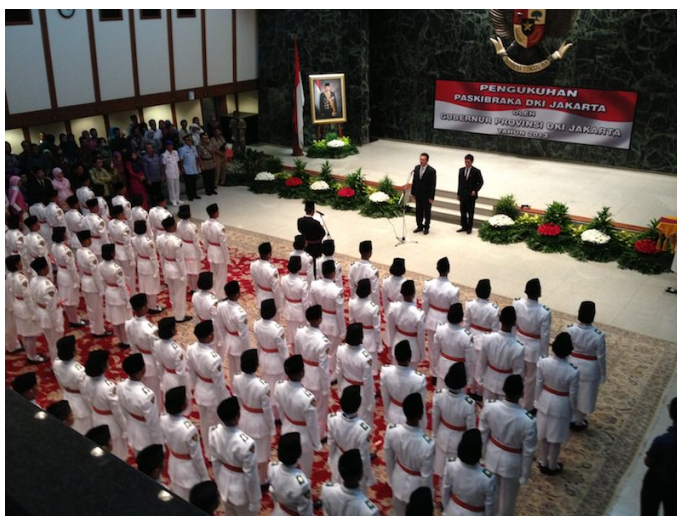
Swearing in of police recruits on National Celebration Day by Tjahaja “Ahok” Purnamas

Only concerned to prevent the re-election of an extremely popular governor, 200,000 demonstrating fanatic Moslems not only opened Pandora’s box, but also secular