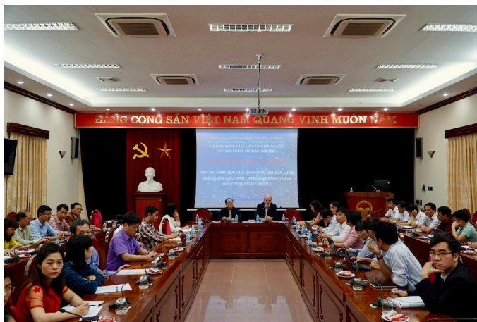
Part of the lecture hall during the seminar