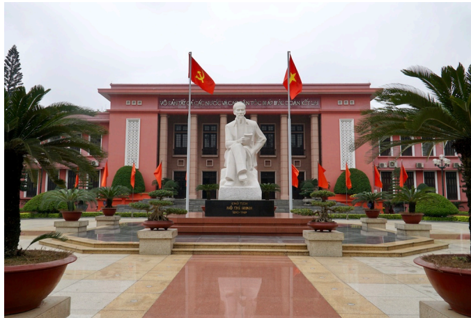
The main building of the university 'National Academy of Politics' with the Ho Chi Min statue

“The Academy of Politics Region I was established in 1953 from Party schools in the region. Set up in the resistance war against French colonialists, the academy was initially tasked with training district-level officials for the Party and the State, serving the resistance war and the national construction. Today, it has become a centre for training leaders and management officials of the Party, the State and socio-political organizations in northern localities, as well as central agencies and sectors under the arrangement of the Ho Chi Minh National Academy of Politics.” It has 2,200 staff, 1,200 researchers and 92 professors.