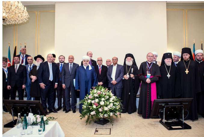
Some of the participants in the group picture with Grand Sheikh Sheikh-ul-Islam Allahshukur Pashazade (center)