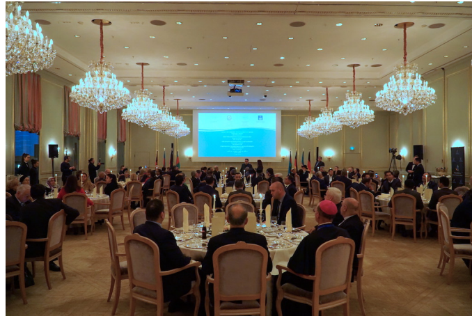
View into the hall from behind at the banquet