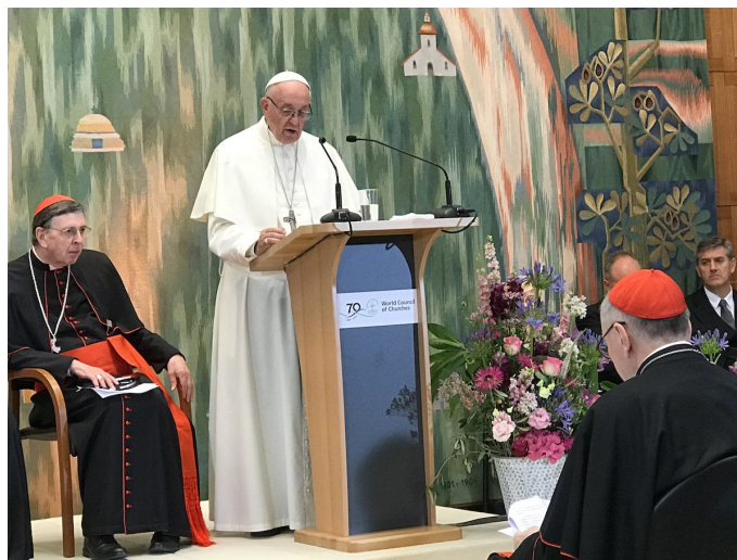
This photo was taken during the very moment the Pope spoke the sections quoted

I sat three meters from the lectern, when the Pope said those surprising words (see photo), yet I had to wait until now, as now everything has been published and translated. The World Evangelical Alliance (WEA) could not have said it more clearly. In all friendship and in the knowledge that the WCC is taking mission seriously again and that the WCC mission commission in its latest mission document of 2012/2013 gives a prominent place to the term 'evangelism,' one can only agree with the Pope's concern.