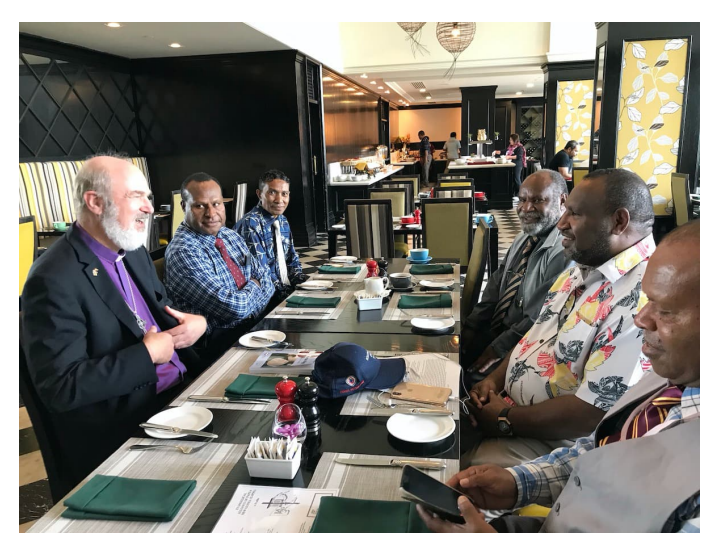
Working breakfast of Thomas Schirrmacher with the Prime Minister of Papua New Guinea James Marape (2nd from right) and the board of the Evangelical Alliance of Papua New Guinea

Nominally, 96 percent of the 6.8 million inhabitants are Christian, although many elements of the indigenous religions are still in practice. Due to the history of the mission, each of the approximately 1000 ethnic groups with 800 languages usually has a certain Christian denomination, with Catholics (20 percent), Lutherans (19.5 percent), Uniates (11.5 percent), Adventists (10 percent) and Pentecostals (8.5) percent) forming the largest deno-Beside minations. the