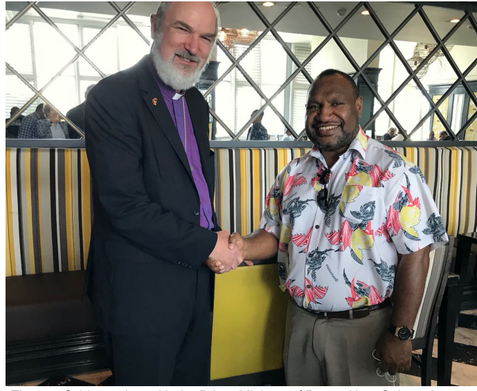
Thomas Schirrmacher with the Prime Minister of Papua New Guinea James Marape

million citizens, situated in the eastern part of the isle of New Guinea - is one of the poorest nations in the world, despite its rich mineral resources. Corruption is widespread. Corrupt politicians profit primarily from the illegal clearing of the rainforest. Papua New Guinea ranks 153<sup>rd</sup> in the United Nations Development Index.