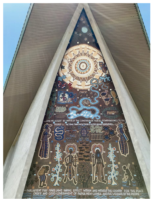
Front of the Parliament of Papua New Guinea

Education from 2008 to 2011 and Minister of Finance from 2017 to 2019.