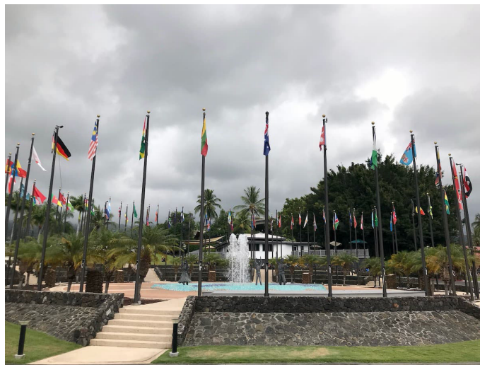
The central flag and prayer place of the University of the Nations, Kailua-Kona (Hawaii)

The two German visitors were particularly impressed by the extensive gardens and facilities for environmental education. All students there learn not only how to think ecologically, but also how to produce ecologically clean drinking water and food in poor areas of the world using the simplest means available.