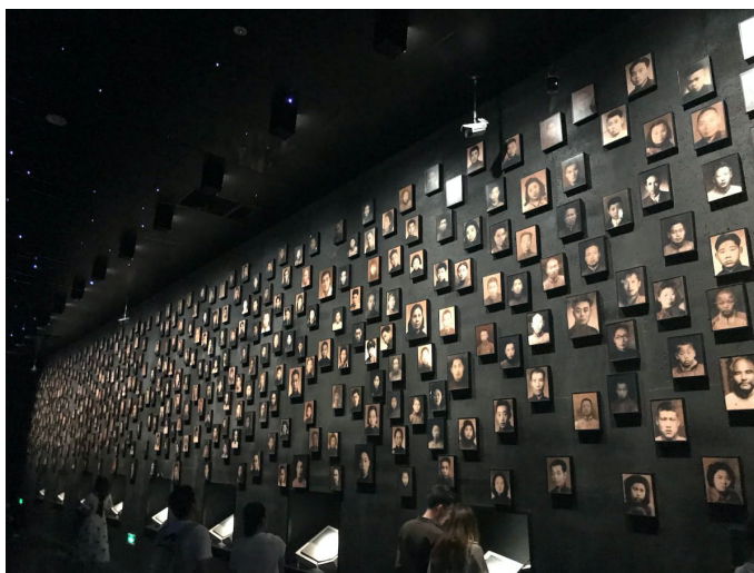
Photo wall with victims of the massacre at the Memorial Hall in Nanjing (China)

The Nanjing Memorial Hall was built in 1985 and renovated and enlarged in 1995. The memorial exhibits historical records and objects, and uses architecture, sculptures, and videos to illustrate what happened during the Nanjing Massacre. Many historical items were donated by Japanese members of a Japanese-Chinese friendship group, which also donated a garden located on the museum grounds. The memorial occupies a total area of approximately 28,000 square meters, including about three thousand square meters of building floor space.