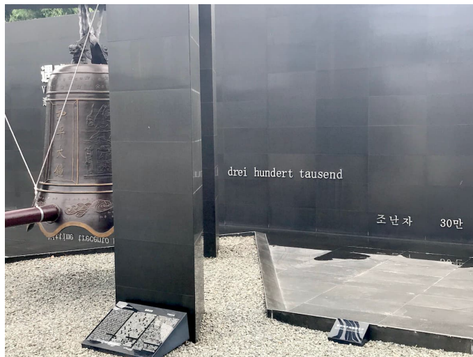
Number of victims in German in the courtyard of the Memorial Hall in Nanjing (China)

The Memorial Hall of the Victims in Nanjing Massacre by Japanese Invaders is a museum to memorialize those that were killed in the Nanjing Massacre by the Imperial Japanese Army in and around the then capital of China, Nanjing. It is located in the southwestern corner of Nanjing, known as Jiangdongmen, near a site where thousands