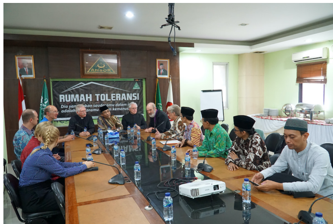
Leading figures from the WEA and Humanitarian Islam movement meet at the Jakarta headquarters of the NU young adults movement, Gerakan Pemuda Ansor. The banner in the background states in Indonesian, “House of Tolerance: He who is not your brother in faith is your brother in humanity.”

A joint platform for the following Bonn organizations on the basis of the Evangelical Alliance: