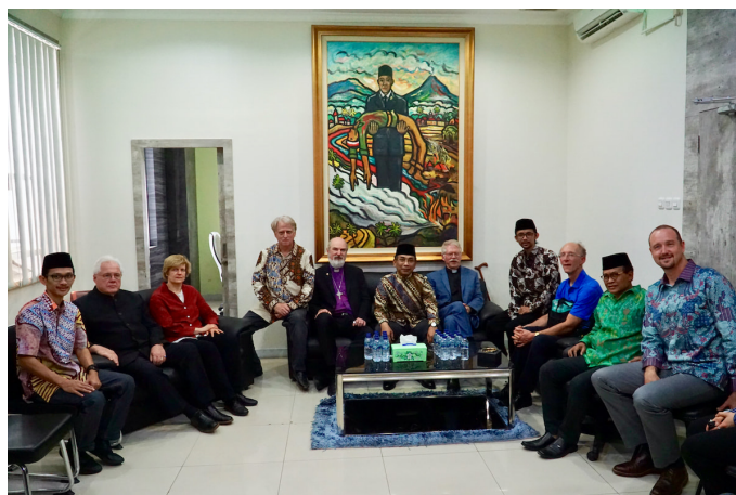
World Evangelical Alliance and Humanitarian Islam leaders sit beneath a painting that depicts Indonesia's founding father, Sukarno, cradling a barefoot independence martyr slain by Dutch colonial forces in late-1940s Java. A crucifix dangles from the young man's neck. Sri Ayati's Legacy hangs in the Jakarta headquarters of Nahdlatul Ulama's young adults organization, GP Ansor, and has become a potent symbol of the Humanitarian Islam movement.

The Muslim participants represent Humanitarian Islam , which is rooted in the Nahdlatul Ulama (NU), with an estimated membership of more than 90 million, primarily in its home country of Indonesia. Since its founding almost a century ago, NU has gained wide recognition for its promotion of a version of Islamic orthodoxy characterized by respect