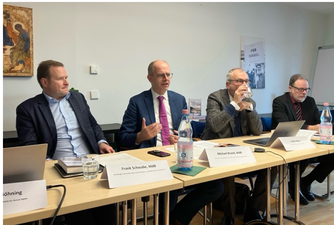
(from left): Frank Schwabe (Federal Government Commissioner for Religious Freedom and Belief), Michael Brand (CDU/CSU parliamentary group spokesman on human rights and humanitarian aid), Volker Beck (President of the German-Israeli Association) and Frank Heinrich (Chairman of the Evangelical Alliance in Germany) during the press conference