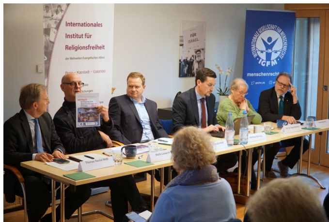
During the press conference

And new developments such as artificial intelligence are leading to new challenges internationally. All of this affects religious majorities and minorities as well as people who do not wish to follow any religion.”