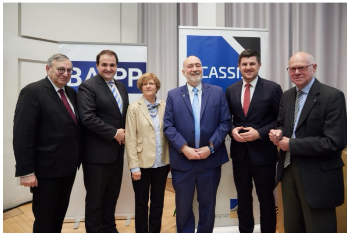
The participants of the panel discussion