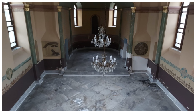
The empty church in the French Church in Bursa

(Istanbul/Bonn, 10.03.2025) On Sunday, February 16, the last service of the Protestant congregation in Bursa (Turkey) took place in the French Church with about 80 visitors. Afterwards, all the congregation's belongings had to be cleared out. This marks the end of more than 21 years of largely unproblematic use of the church building, which dates back to the 19th century. In addition to the Protestant congregation, which regularly held its Sunday services here, Catholic and Orthodox services have also been held in the building for a number of years.