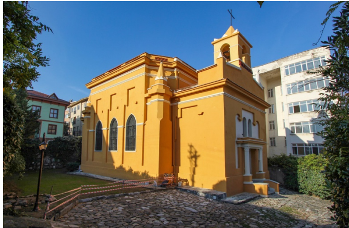
The French Church in Bursa

A few days ago, a foreign Christian woman in Izmir received a message that her application to extend her visa had not been approved and that she therefore should come to the authorities. When the whole family was at the office, it also became clear that the work visa of the husband, who worked as an engineer in a Turkish company, had been canceled after he had received a “code”. As a result, he was immediately taken into custody pending deportation. The wife, for her part, had to sign a document stating that she would leave the country with the children within ten days. Both are now to leave Turkey – separately – over the next few days.