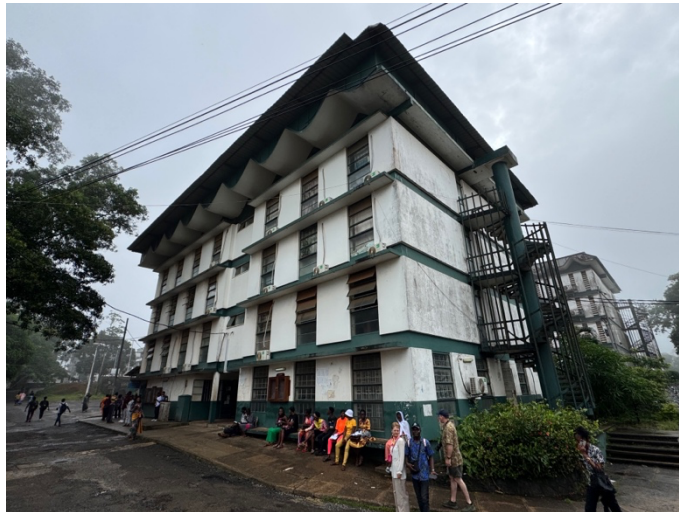
The headquarters of the Fourah Bay College Freetown Sierra Leone

Although the college was founded by the British and has cooperated with the British University of Durham from early on and continues to do so today, it was also under the direction of German linguists and cultural researchers for many years, and its unusually broad combination of academic traditions has shaped the entire educational landscape of Sierra Leone. In the second half of the 19th century, Fourah Bay College developed from a purely missionary school into a fully-fledged college offering not only theology but also philosophy, languages and natural sciences. In 1876, the college became the first West African college to be affiliated with Durham University in England, enabling graduates to obtain a globally recognised degree. The college's reputation spread quickly and students from all over West Africa came to Freetown.