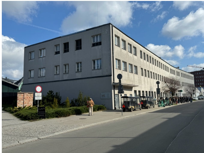
Schindler's factory in Krakow