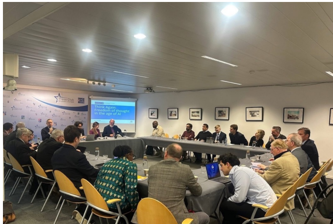
The FoRB Roundtable EU Brussels in its last meeting together with the OSCE/ODIR