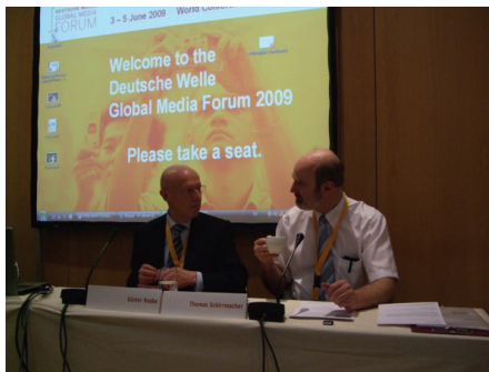
Pic1: Global Media Forum 2009

Unfortunately there are too few citizens, few too Christians, few too many theologians, and few too many ethicists who take advantage of the opportunity to thoroughly inform themselves about internal Bundeswehr questions and then to participate in discussions about the ethics of the 'inner leadership' of the Bundeswehr , either where they are stationed or where they find themselves in action. I have in any case always been cordially received by the Bundeswehr as 'moral support' just as much as a civil critic.