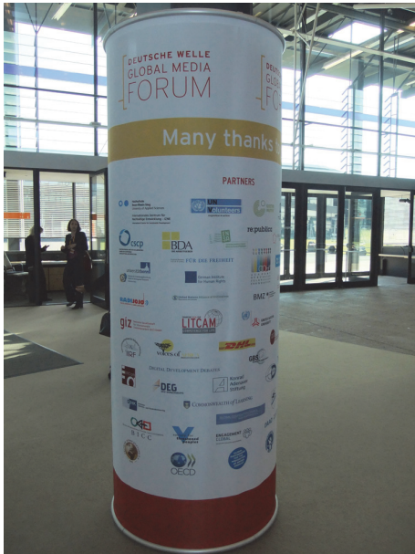
IIRF as partner left forth from below

measures should be a more effective monitoring to detect critical organizations and initiatives early enough to prevent later real terrorist attacks.