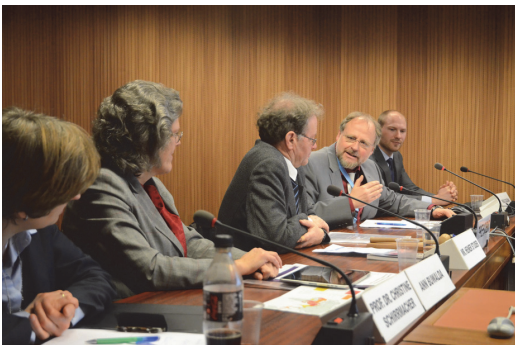
UN-Rapporteur Heiner Bielefeld talking to Christine Schirmmacher (left)

Although only very few countries in the world currently have written laws which forbid apostasy from Islam (or another religion) and threaten apostasy with punishment, the reality is often different from the written law. Especially converts, but also adherents of non-recognized religious minorities, suffer from serious discriminations, violations of their rights, harassment, and partly persecution and mistreatment. Some are even killed because they have changed their religion or no longer remain adherents of the locally propagated version of Islam. People who defend the unwritten law of apostasy