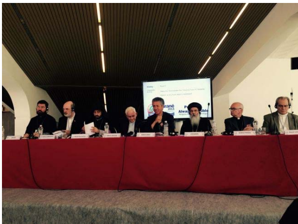
The panel on the persecution of Christians

Theological Commission of the World Evangelical Alliance www.worldevangelicals.org/commissions/tc/