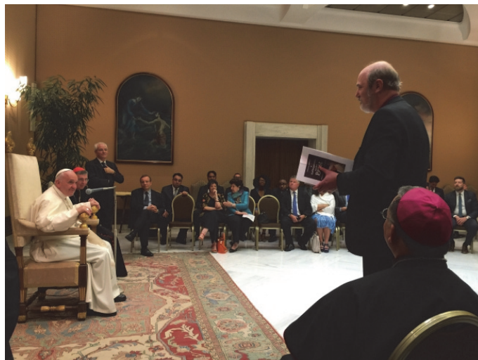
Schirmmacher introduces the book Coffee Breaks with the Pope to the Pope

From the papal side, only Cardinal Kurt Koch, the President of the Papal Council for Promoting Church Unity (PCPCU), participated. At the beginning, Schirmmacher led a discussion with Koch on the future of the cooperation between the PCPCU and the