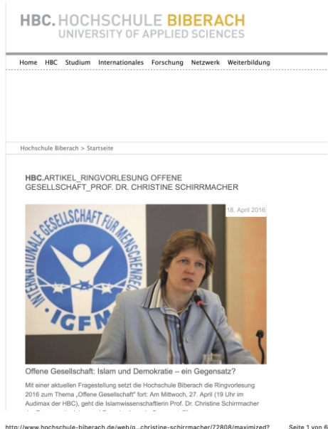
Screenshot of the Invitation

Artikel_Ringvorlesung Offene Gesellschaft...acher - Startseite - Hochschule Biberach 08.06.16, 12:42